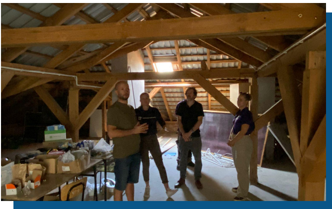
BORATYN SHELTER before

As our work in the Przemysl area comes to a close towards the end of February, and with increased need identified around the city of Krakow, AHAH plans to continue our support of refugees here with shelter repairs, distribution of supplies and supporting local capacity.