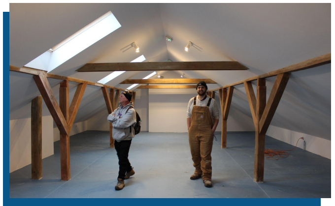
BORATYN SHELTER after

Only 5 miles from the Ukrainian border, AHAH converted the attic space at Boratyn Shelter to accommodate an additional 60 refugees.